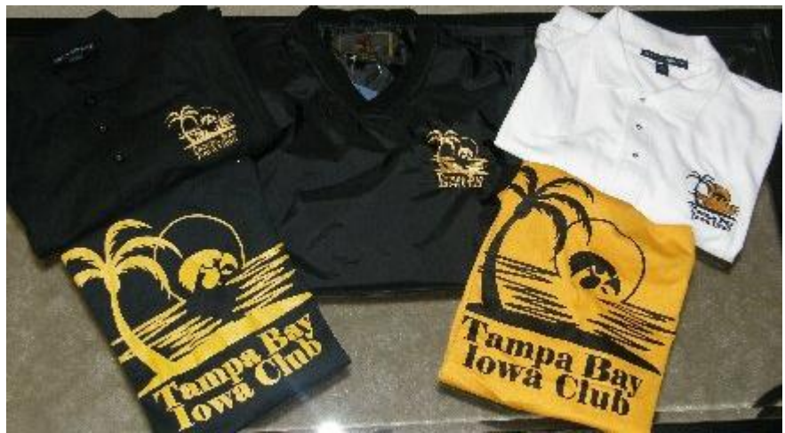
Shown are clockwise from upper left: Black polo, Windshirt, White polo, Gold t-shirt; Black t-shirt (t-shirts have Tigerhawk on left chest)