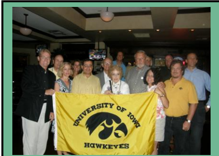
Hawkeye Happy Hour at Maggiano's. Sono di...TBIC

On August 21 st sixteen members of the TBIC met for a Hawkeye Happy Hour (HHH) at Maggiano's Little Italy in West Shore Plaza.