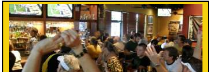
TBIC'ers Cheer on the Hawkeyes

For the past three years the Tampa Bay IOWA Club has conducted a food drive for the Hope Children's Home of Tampa. Each year the TBIC members have increased their donations for this event. At this year's annual food drive event, which was held on October 2 nd , TBIC members generously donated more than 800 food items!