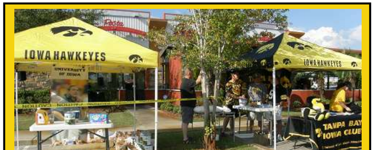
TBIC Annual Tailgate Party at PSU Game

For the past three years the Tampa Bay IOWA Club has conducted a food drive for the Hope Children's Home of Tampa. Each year the TBIC members have increased their donations for this event. At this year's annual food drive event, which was held on October 2 nd , TBIC members generously donated more than 800 food items!