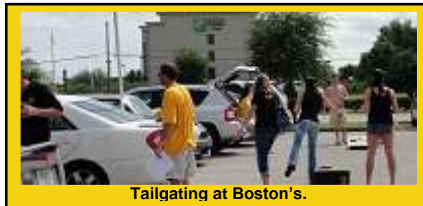
Tailgating at Boston's.