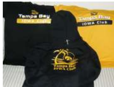
New t-shirt and sweat-shirt designs