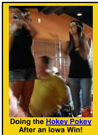
Doing the Hokey Pokey After an Iowa Win!