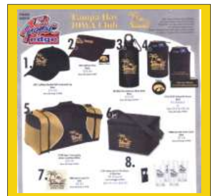
Old favorites and new items