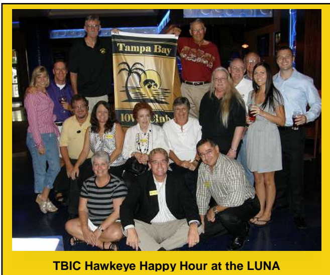
TBIC Hawkeye Happy Hour at the LUNA

On September 16th, 16 TBIC members met at the Hilton Carillon Park LUNA to enjoy the drinks and appetizers offered by this upscale venue.