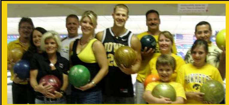
TBIC Bowling Team Members before the Arizona Game

TBIC members have attended 2010 game watches in record crowds. 150 were at the Iowa State game; 57 at a very late Arizona game that kicked off at 10:30pm; etc., for a total attendance this year of 527! Members have had some great fun at the Outdoor Tailgate Party with carnival games at the Penn State Homecoming game, a pre-game bowling event before the Arizona kickoff, tenderloins on the patio at Boston's, and plenty of prizes drawn each time Iowa scores. Join us at Boston's on 10/16!