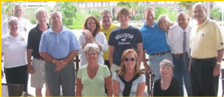
TBIC'ers at Kona Grill for Hawkeye Happy Hour

International Plaza 2223 North Westshore Boulevard Tampa, Florida 33607