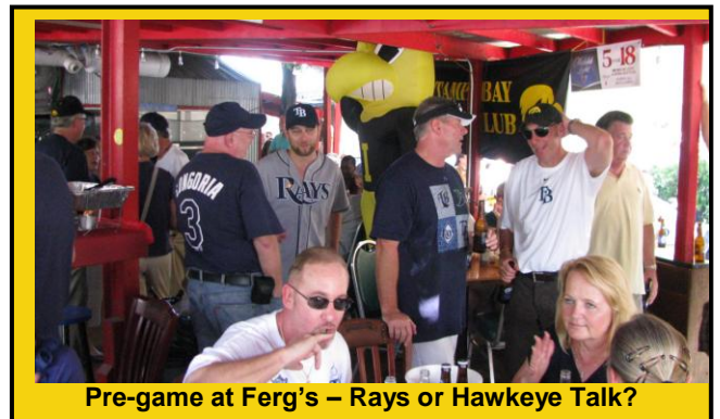
Pre-game at Ferg's – Rays or Hawkeye Talk?