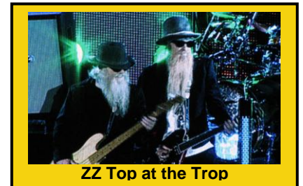
ZZ Top at the Trop