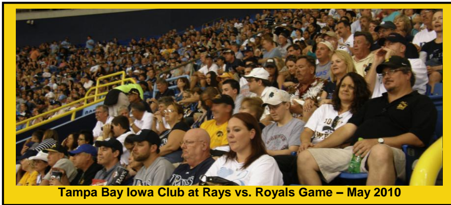
Tampa Bay Iowa Club at Rays vs. Royals Game – May 2010

The TBIC Board wishes to extend our appreciation for the great turnout and support of this popular Tampa Bay Iowa Club event.