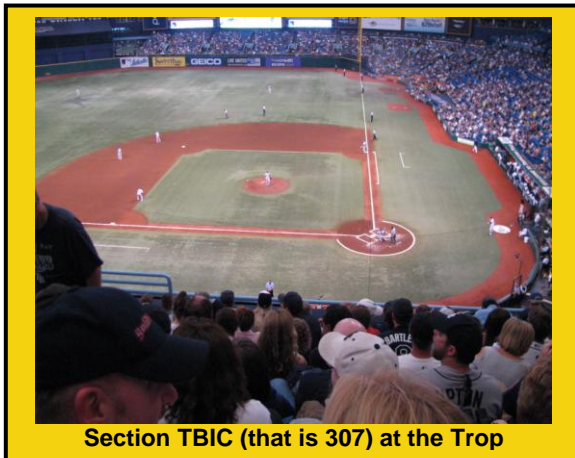
Section TBIC (that is 307) at the Trop