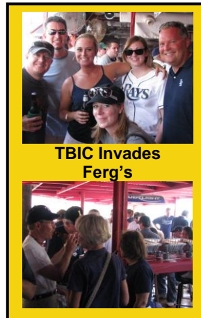
TBIC Invades Ferg's