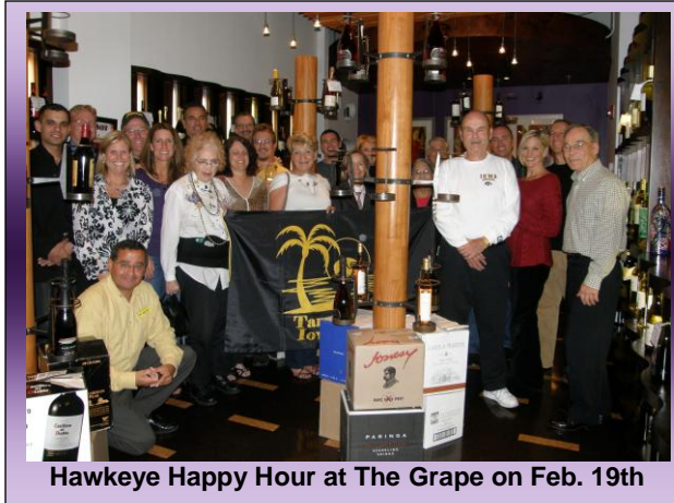
Hawkeye Happy Hour at The Grape on Feb. 19th

This was the largest group to date that has attended a HHH. In addition to the excellent wine selections, the conversations and