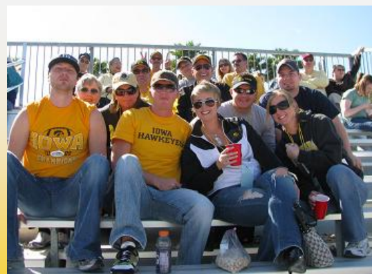
TBIC Members Cheer on the Hawkeyes at Inaugural Big East/Big Ten Baseball Challenge