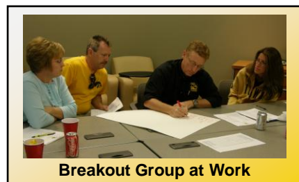
Breakout Group at Work