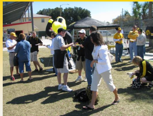
TBIC Pre-Game Tailgate Before Iowa v. St. John's Game

The Big EAST/Big 10 Challenge" will return to Tampa Bay in 2010.