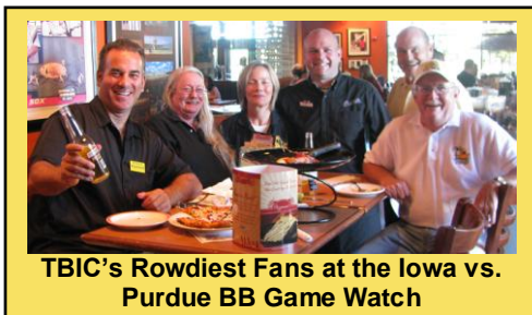
TBIC's Rowdiest Fans at the Iowa vs. Purdue BB Game Watch

Boston's for the Big Ten Wrestling Finals . An email notification will be sent out as a reminder before the Mat Watch.