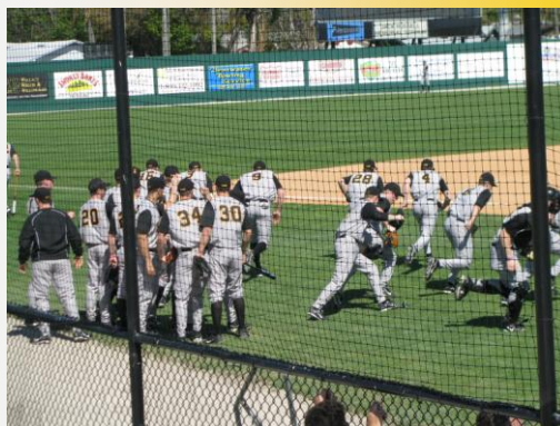
Iowa Hawkeyes Hustle on Field at Jack Russell Stadium to Face St. John's