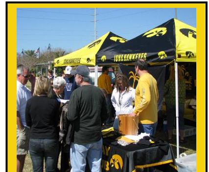
Registration for Door Prizes by the Food Tents