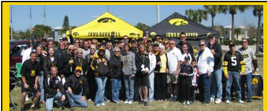
82 Tampa Bay Iowa Club Members and Guests at Sunday's BBQ

Before Sunday's game, the Tampa Bay Iowa Club sponsored a tailgate party with Italian sausages, brats, potato salad, baked beans, chips, cup cakes, and beverages for 82 Iowa fans, including team family members.