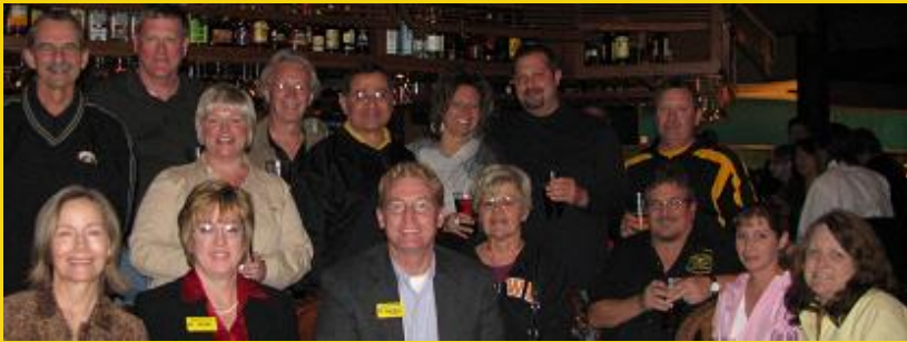
TBIC'ers at Bahama Breeze for Hawkeye Happy Hour

Hawkeye Happy Hour: On Thursday February 18th, twenty-three TBIC members met at Bahama Breeze to gather on an outside patio to enjoy libations and conversation. Instead, since this one of the coldest winters on record, everyone gathered in a small area near the bar as the temps outside were below 50.