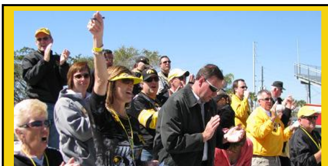
TBIC Fans Cheer on Iowa at Jack Russell Stadium