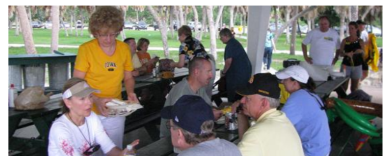
▲ TBIC's 2009 Picnic at Fort De Soto Park ►