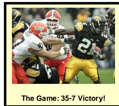
The Game: 35-7 Victory!

TBIC's package includes hotel, game tickets and a pre-game tailgate. All members and friends are welcome to participate