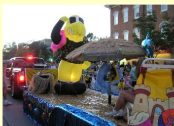
The Float: Homecoming 2005

40 members made the trip to assemble a great looking TBIC float. The members marched in the