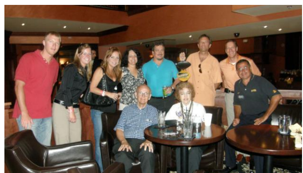
TBIC Hawkeyes at The Venue