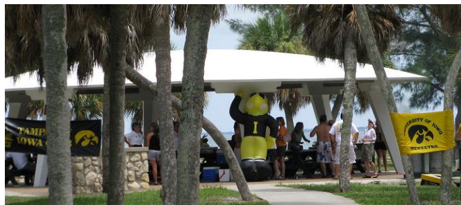
▲ TBIC's 2009 Picnic at Fort De Soto Park ►

The Tampa Bay Iowa Club is part of the UI Alumni Association (UIAA) club program whose support is vital to our success. Membership in the UIAA helps support our activities. If you are not a member, let us know and we will direct you to membership information. The Tampa Bay Iowa Club offers events and programs for the 3,000 Iowa alumni and friends in our area. We've given over $10,000 for UI student scholarships and have donated over $7,000 for UI flood relief and flood tornado relief programs. We host a Hawkeye Happy Hour every month and we sponsor game watches for all the football games in the fall and key basketball games in the winter months. Plus lots of other activities!