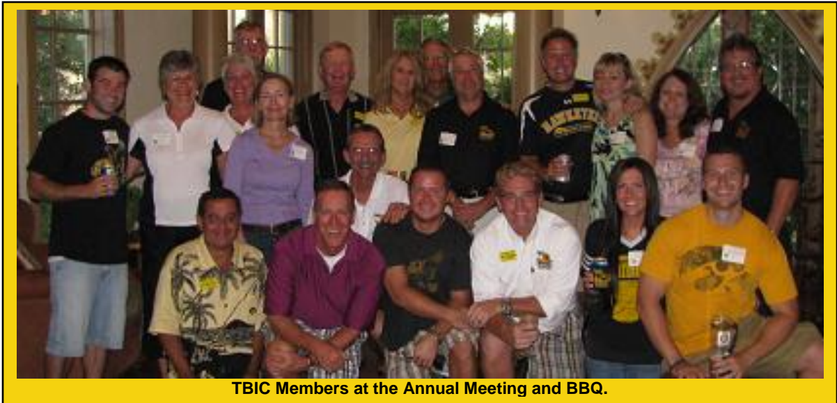
TBIC Members at the Annual Meeting and BBQ.

On Saturday June 19 th , thirty five TBIC members attended TBIC's 2010 Annual Meeting and membership appreciation day, combined with June's Hawkeye Happy Hour.