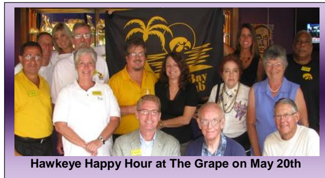
Hawkeye Happy Hour at The Grape on May 20th

Don't be shy - join in the fun next month.