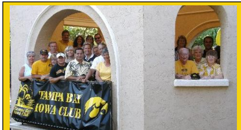
A Great Time at TBIC'2009 Annual Meeting!