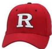
GAME #1 Friday 2/26/10 Iowa vs. Rutgers Game Time: 10 am Al Lang Stadium