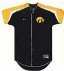
IOWA HAWKEYE BASEBALL

10 Big Ten and 8 Big East teams are scheduled in thirty games to be held February 26-28, 2010, at venues in St. Petersburg, Clearwater and Dunedin: Al Lang Stadium, Bright House Field, Dunedin Stadium, Jack Russell Stadium, and Naimoli Complex.