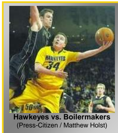
Hawkeyes vs. Boilermakers