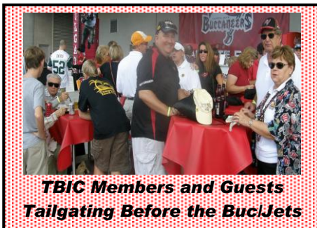
TBIC Members and Guests Tailgating Before the Bucs/Jets

401 N. Dale Mabry, Tampa, FL (813) 872-5900