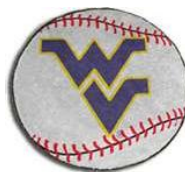
GAME #2 Sunday 2/27/10 Iowa vs. W. Virginia Game Time: 1 pm Naimoli Complex