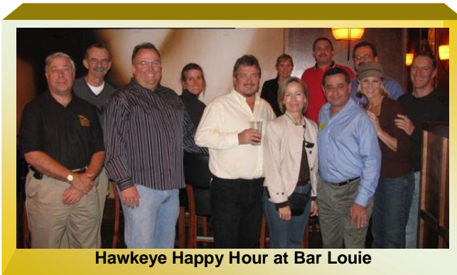
Hawkeye Happy Hour at Bar Louie

On November 20th, a dozen members of the TBIC met for a Hawkeye Happy Hour (HHH) at Bar Louie located at the International Mall.