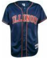
GAME #1 Friday 2/20/09 Iowa vs Illinois Time: 4 pm Jack Russell Stadium