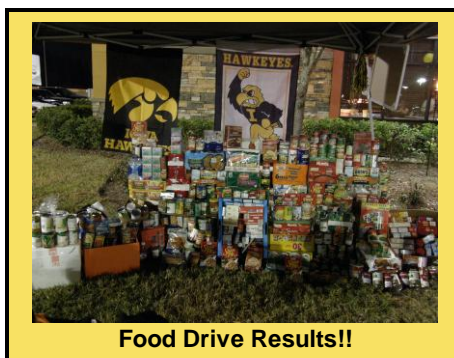
Food Drive Results!!

The IA/MN game was kicked off with a tailgate party from