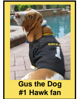
Gus the Dog #1 Hawk fan