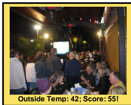
Outside Temp: 42; Score: 55!

5-7 pm on Boston's patio. At kickoff 93 members were in attendance. OF NOTE: members donated food that was gratefully accepted by the Hope Children's Home of Tampa, for Thanksgiving.