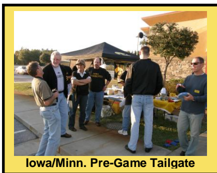
Iowa/Minn. Pre-Game Tailgate