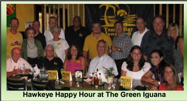
Hawkeye Happy Hour at The Green Iguana