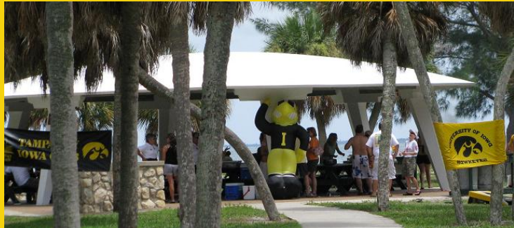
Herky Welcomes Guests to TBIC's Picnic at Fort De Soto Park

It was great to see all of the extended TBIC families and meet new friends and members.