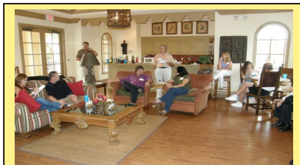
Wine Social at Echelon at the Reserve Clubhouse

To summarize the meeting: All current Board