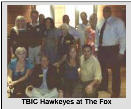
TBIC Hawkeyes at The Fox

On July 17th twenty members of the TBIC met for a Hawkeye Happy Hour at The Fox. Known as the “Cool Jazz Club” the members enjoyed the music, light but gourmet fare, and array of libations.