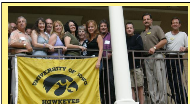
2008 TBIC Board Meeting Attendees

The Tampa Bay Iowa Club held it's annual meeting on July 11, 2008 at the Echelon at the Reserve Clubhouse in St. Petersburg. The meeting is an annual requirement for fulfillment of the TBIC By-laws.