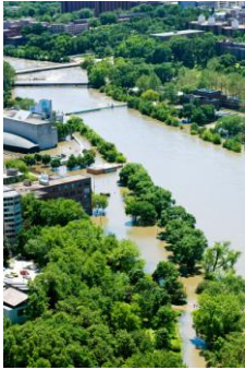
Iowa River Cresting at Record 31 Feet June 18, 2008