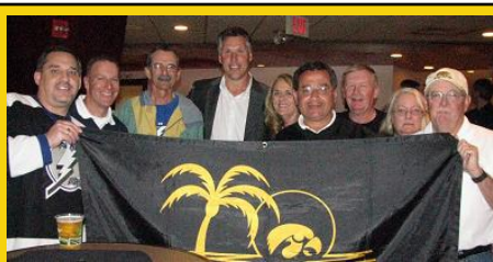
TBIC Gang Hanging With Former Lightning Player Dave Andreychuk

Wrestling update: on March 7 th Iowa won the Big Ten Wrestling Finals. 10 TBIC die-hard fans attended this third annual Mat Watch and cheered on Iowa as they qualified 10 wrestlers for the NCAA's. They won their 23 rd NCAA Championship on 3/20!