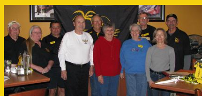
TBIC Mat Watchers at Boston's

MSU/Big Ten Golf Tourney: on March 7 th TBIC had one team entered in the tournament. The team did not place but enjoyed the MacDill South Golf Course.