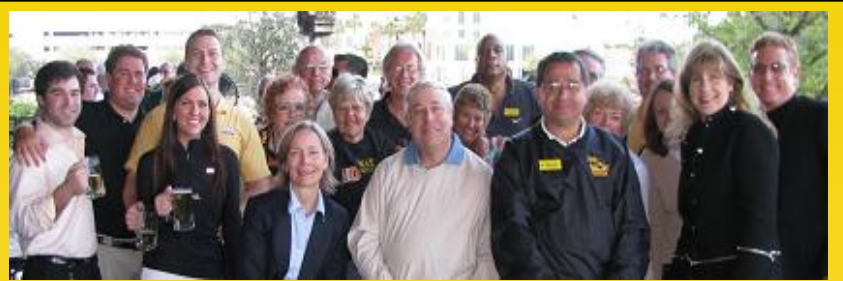
TBIC'ers at the Courtside Grille for the March Hawkeye Happy Hour