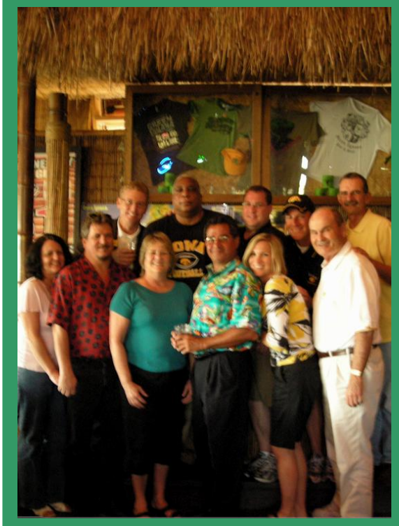
Happy Hour Hawkeyes At The Green Iguana

On March 20, 2008 the TBIC club kicked off the 2007 Hawkeye Happy Hour season at the Green Iguana located on Anderson Road.